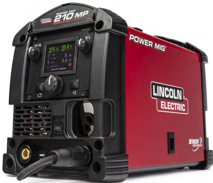
K3963-1 Power MIG 210 MP shown